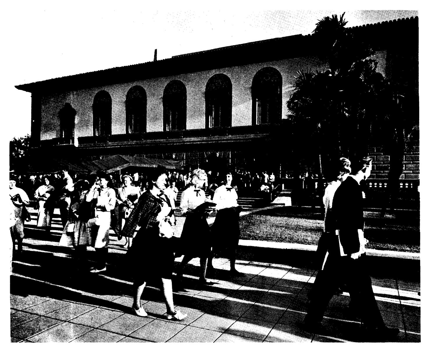
Outside view of the Civic Auditorium showing brethren and Ambassador students leaving one of the services.

brethren in attendance even on the weekly Sabbath to hear the sermons. Many had come in from Wisconsin, Minnesota, Iowa, Nebraska, Michigan, Indiana, Kentucky, and other outlying states to attend the entire Festival in Chicago.