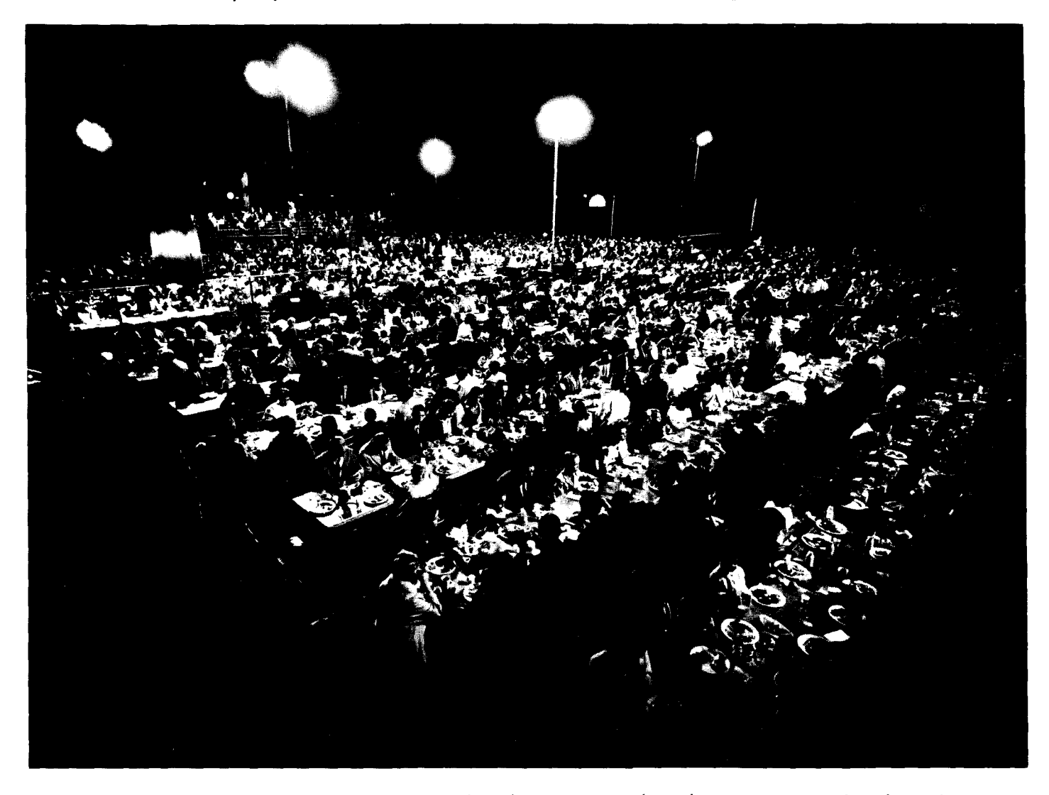
The delicious feast on the "Night to be Remembered" was enjoyed on the tennis courts of Ambassador College in Pasadena.

"We were blessed with splendid cooperation from all deacons, deaconesses,