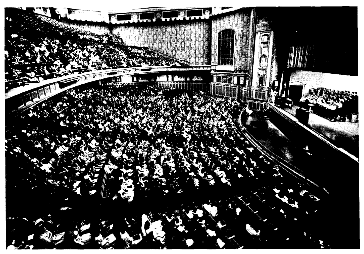
Over 2000 brethren assemble in beautiful Pasadena Civic Auditorium — with Ambassador Chorale on stage. This was on first Holy Day of the Feast of Unleavened Bread.